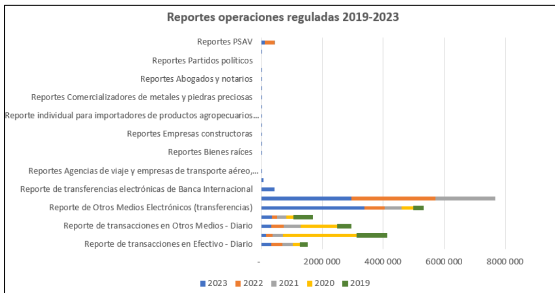
Graph 3.2. Behaviour of regulated transaction reports by year

228. The FIU also receives and analyses data on cross-border declarations of cash or bearer negotiable instruments in amounts equal to or greater than USD 10,000 or its equivalent in another currency. These data are submitted by the DGA. During the period under review, 2,325 declarations were recorded, amounting to USD 49.7 million. However, it should be noted that, at the time of the visit, only data from San Oscar Romero y Galdámez International Airport were available.